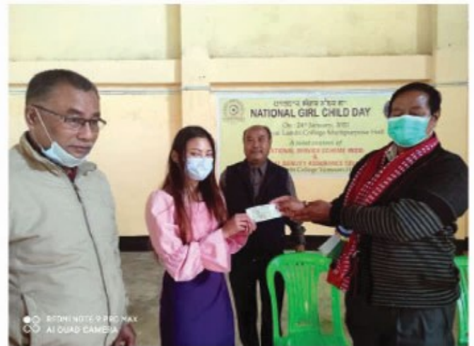
NATIONAL GIRL CHILD DAY