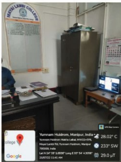
MONITOR CCTV CAMERA