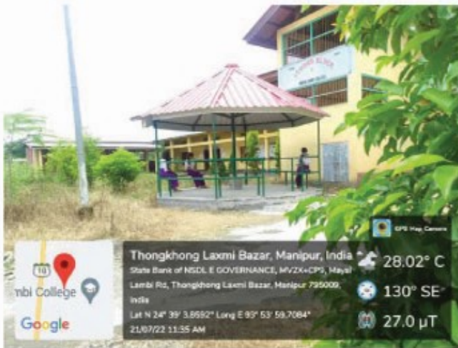
SEPARATE WAITING SHED