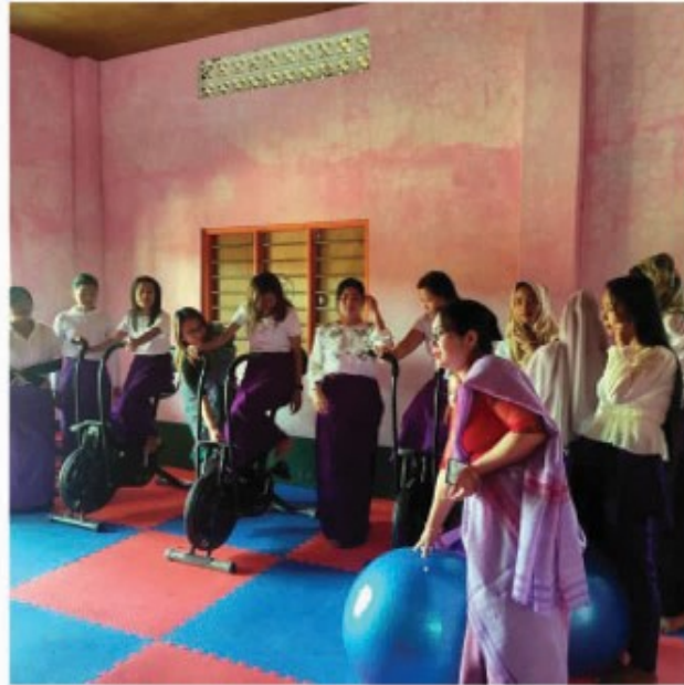
WOMENS' GYMNASIUM & REST ROOM