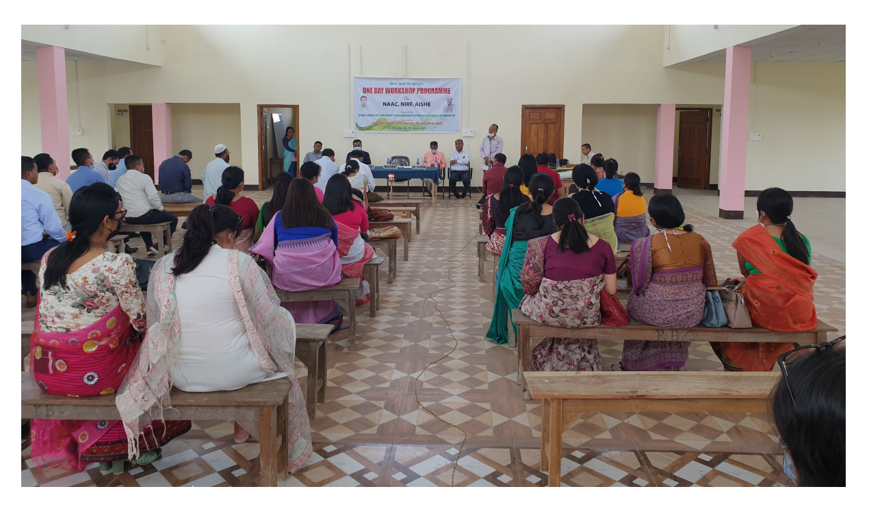
B. Pravabati College, Mayang Imphal