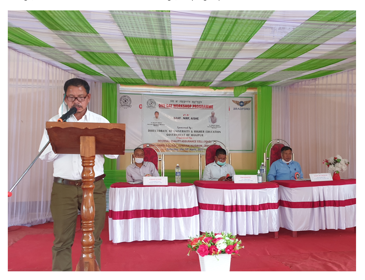
A. Mayai Lambi College, Yumnam Huidrom

A report on Workshop/ Awareness on NAAC, NIRF & AISHE held on 10<sup>th</sup> April, 2021 at Mayai Lambi College, Yumnam Huidrom and Pravabati College, Mayang Imphal.